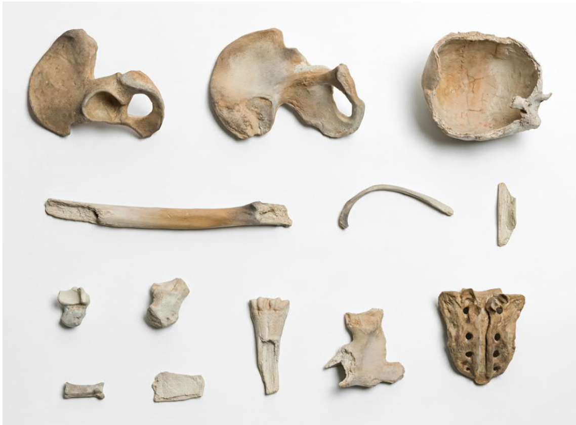
Picture: Ai Weiwei - Remains , 2015